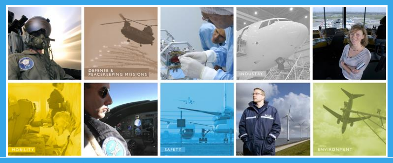
NLR – Dedicated to innovation in aerospace

The NLR, renowned for its leading expertise, professional approach and independent consultancy, is staffed by client-orientated personnel who are not only highly skilled and educated, but also continuously strive to develop and improve their competencies. The NLR moreover possesses an impressive array of high quality research facilities.