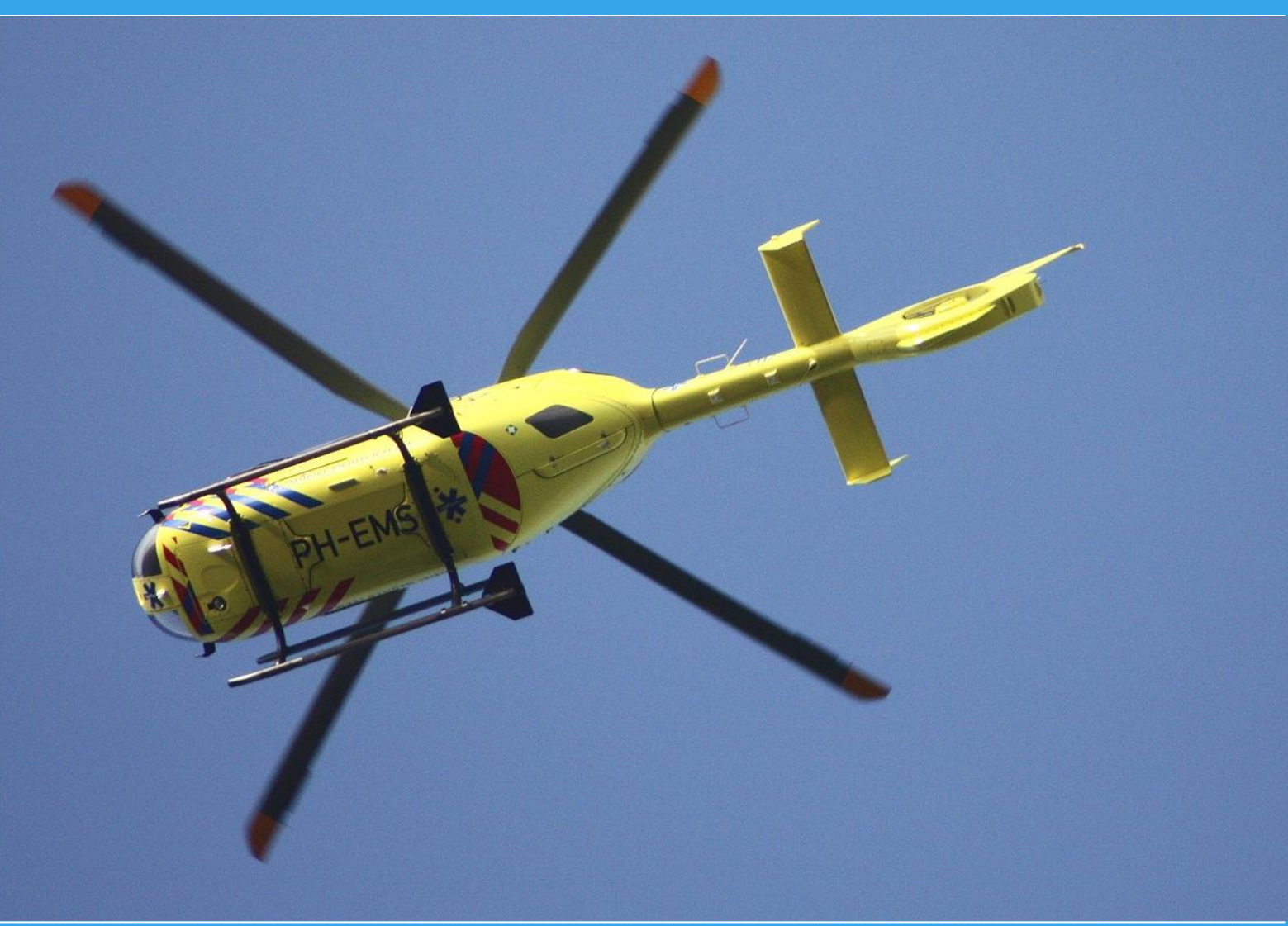
NLR – Dedicated to innovation in aerospace