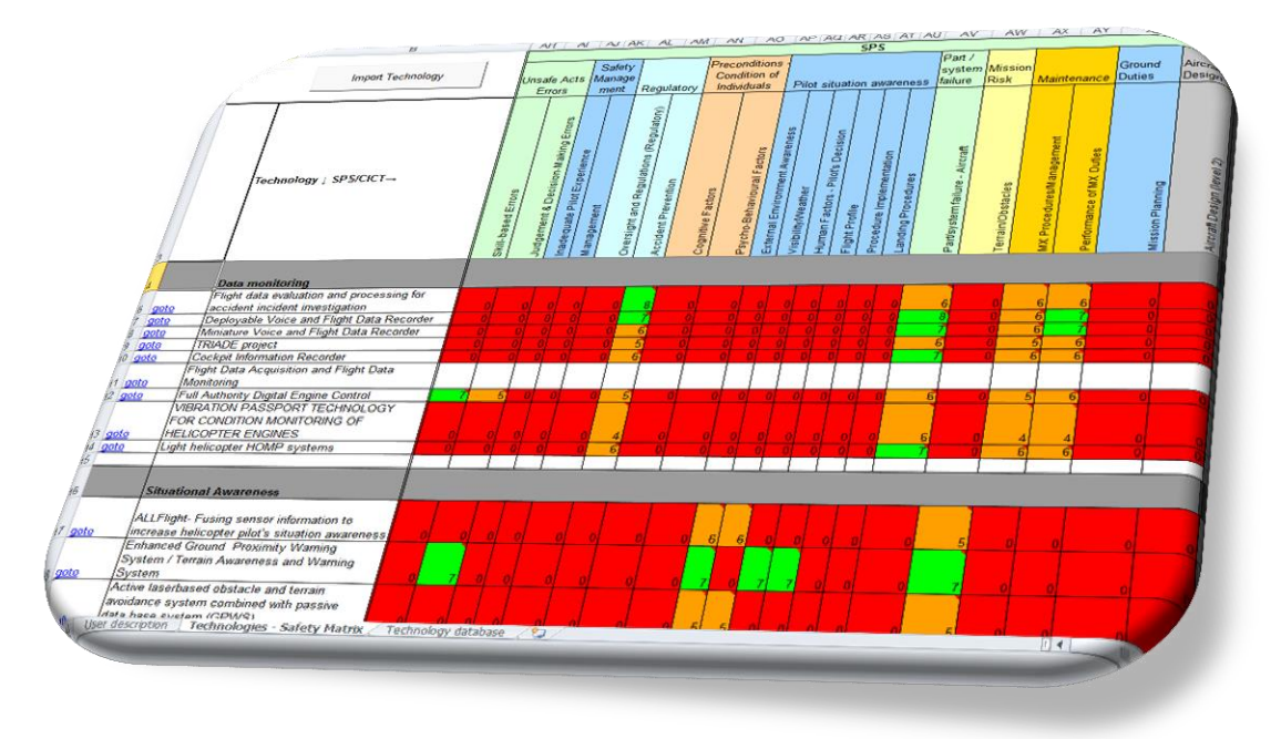
Figure 3-1 Screen shot of rating page in matrix tool

The assessment tool that has been developed by the ST Technology consists of an Excel file with two main tab sheets. One sheet contains a list of technologies (technology database). Besides a short description of each technology, this sheet also contains the Technology Readiness level (TRL, a definition of which is provided in Appendix B) and a link to the source documentation. The other sheet (see Figure 3-1) contains a technology – safety matrix providing rows with all listed technologies and columns with Standard Problem Statements (SPS). On this latter sheet a rating will be provided for each combination of technology and SPS.